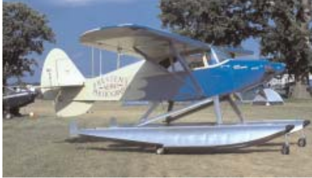
Eric based the Clipper's unique float installation on the struts used on the float-equipped Cessna 150.

The Clipper came into their life right after they were married in 1990.